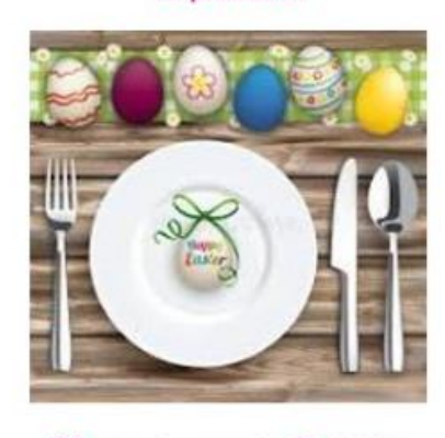
Please sign up in Activities