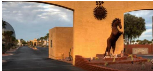
SUNDANCE1 RV RESORT of CASA GRANDE - ACTIVITY NEWS Public group · 13K members