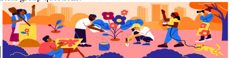
Sundance RV Resort Activities Public group · 132 members

OR follow us on the Facebook Group: SUNDANCE1 RV RESORT of CASA GRANDE - ACTIVITY NEWS Join the group chat for Buy/sell and General group questions.