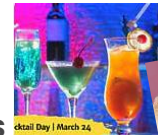
Cheesesteaks and Cocktails