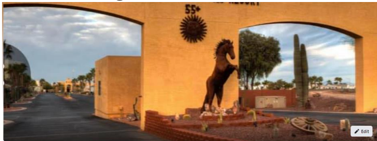
SUNDANCE1 RV RESORT of CASA GRANDE - ACTIVITY NEWS